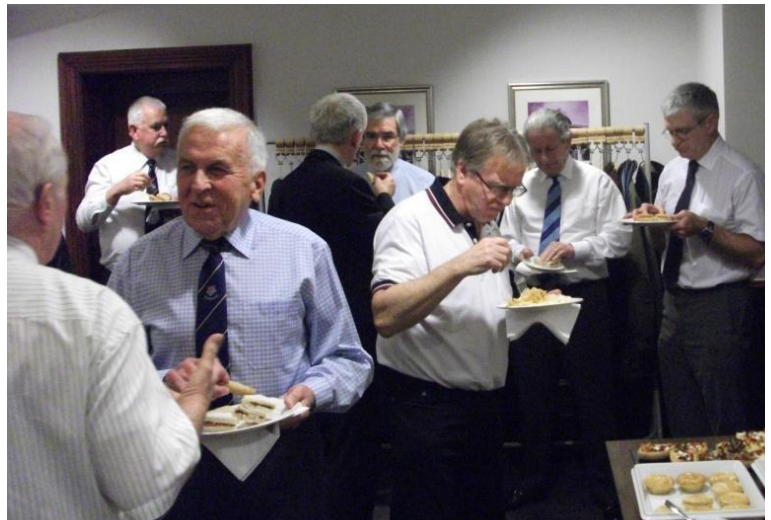
Networking during the lunch break in London

There were positive exchanges of views regarding the role that County RAs are expected to perform, especially in the recruitment process, and these will be taken forward for further consideration.