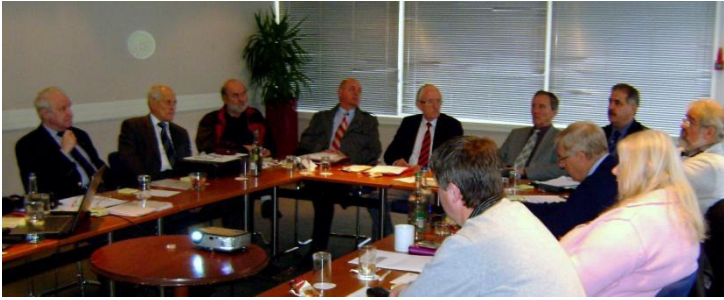
Attentive delegates at the Stoke –on-Trent meeting.

The bad weather in early December meant that the four regional meetings were spread either side of Christmas. However, this did not prevent a good turnout at each venue with nearly all Counties represented.